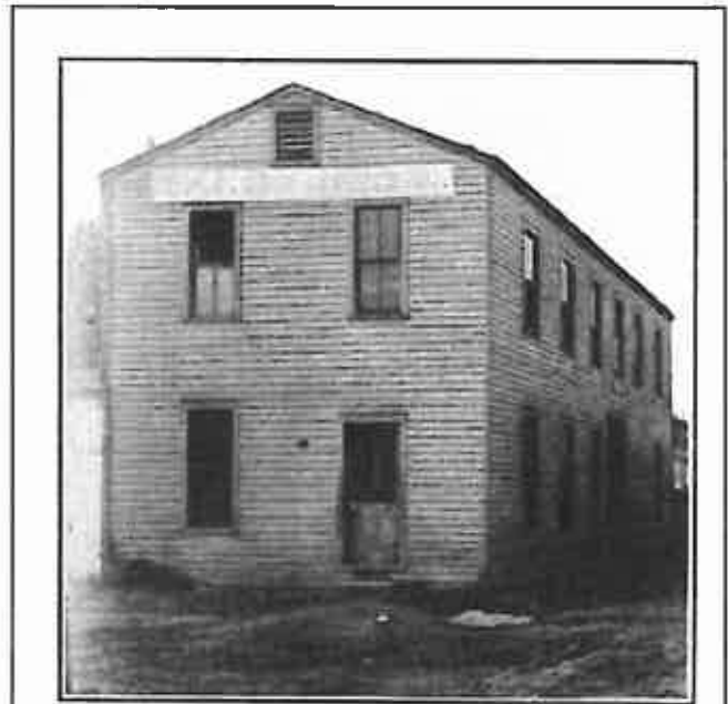
Plant J. Graf Crupper Company.